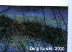
Zeng Fanzhi: 2010

Expanding Horizons: Manufacturing New Landscapes Art - Shanghai Gallery presents the second part of its group exhibition series highlighting landscapes. While the first part, "The City," illustrated how economic reform and rapid industrialization have effected urban environments in China, "Expanding Horizons" explores landscapes as a means of expressing our contemporary world via realism, metaphor and abstraction. Participating artists include Ben Houge, Cindy Ng, Nial O'Connor and VIWA. Art + Shanghai Gallery (6248 4388)