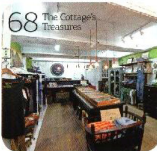
68 The Cottage's Treasures