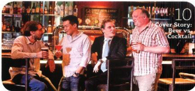
10 Cover Story: Beer vs Cocktail