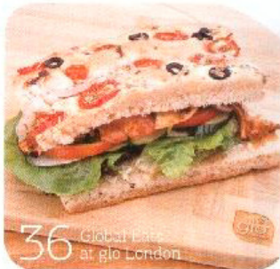
36 Global Eats at glo London