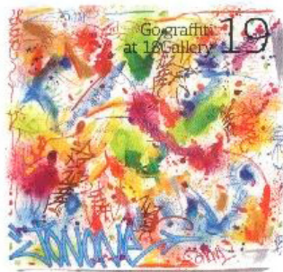
Go graffiti at 18Gallery 19