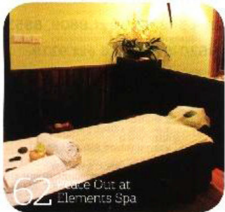
62 Face Out at Elements Spa